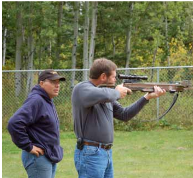
Having fun at Rocky SARs 20th Anniversary Celebration.