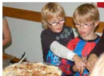
Too many choices!