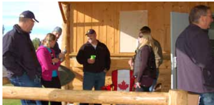
Socializing at Anniversary Celebration.